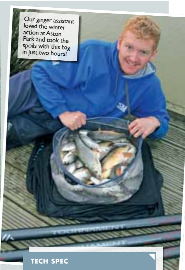
Our ginger assistant loved the winter action at Aston Park and took the spoils with this bag in just two hours!