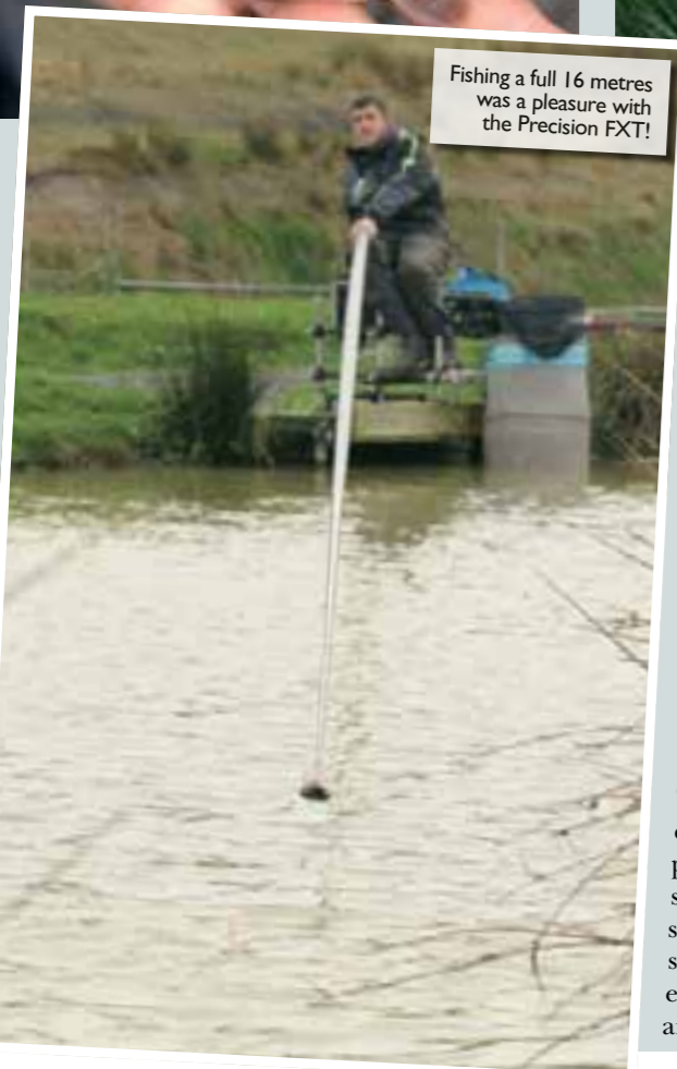
Fishing a full 16 metres was a pleasure with the Precision FXT!