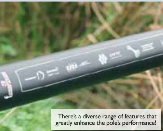
There's a diverse range of features that greatly enhance the pole's performance!