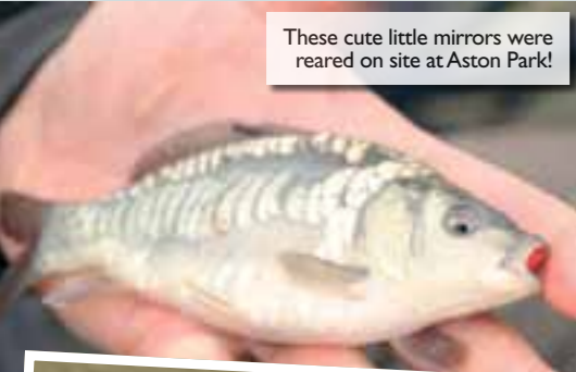
These cute little mirrors were reared on site at Aston Park!