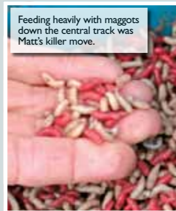
Feeding heavily with maggots down the central track was Matt's killer move.