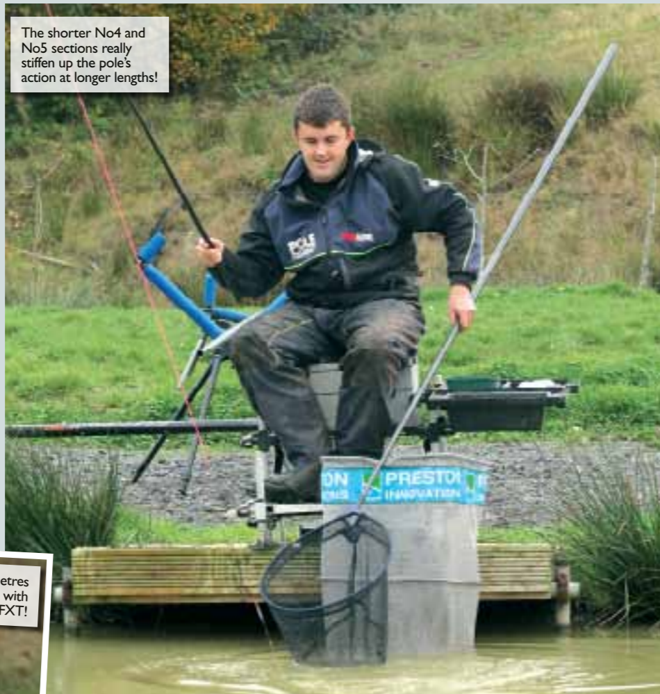
The shorter No4 and No5 sections really stiffen up the pole's action at longer lengths!

I have never tested a pole from Frenzee before, so I was really looking forward to getting on the bank with the FXT! Supplied at 13 metres as standard, but with extensions to take it to its full length of 16 metres, the pole boasts several unique features, which I was looking forward to putting to the test.