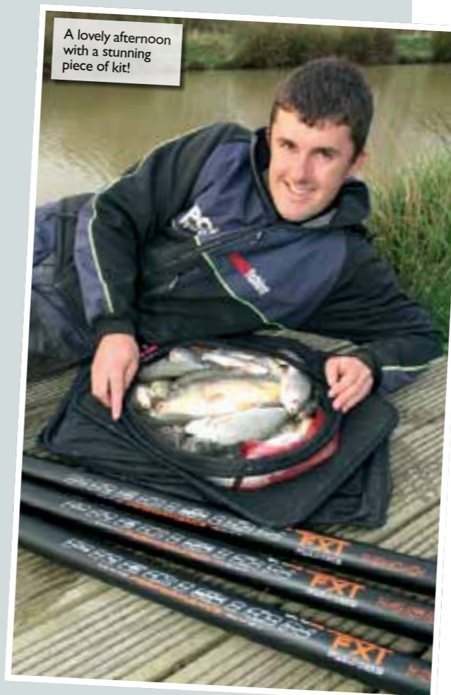
A lovely afternoon with a stunning piece of kit!

So what did I think of it? Where possible, if I don't know the RRP of a pole, I always make a point of testing it before checking the price. The pole performed very well and was exceptionally stiff, light, strong and well balanced.