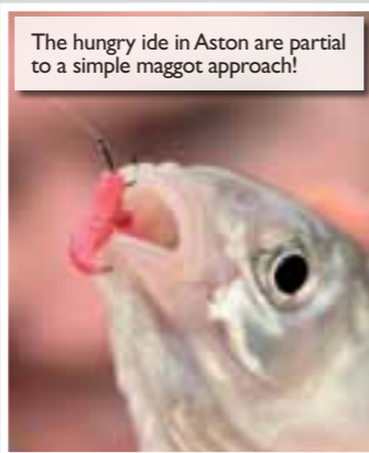
The hungry ide in Aston are partial to a simple maggot approach!